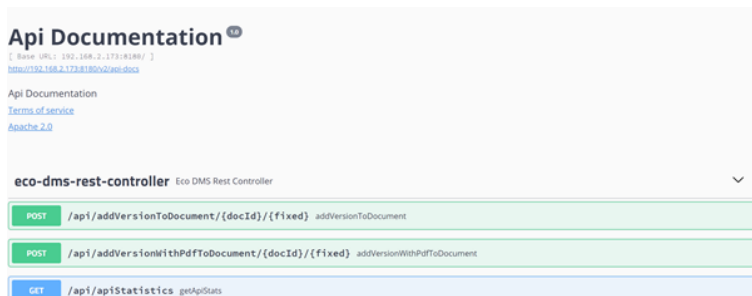
Fig. (similar) 3.1: Example for API Documentation